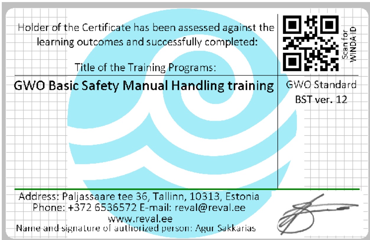
Reverse side of GWO MH certificate