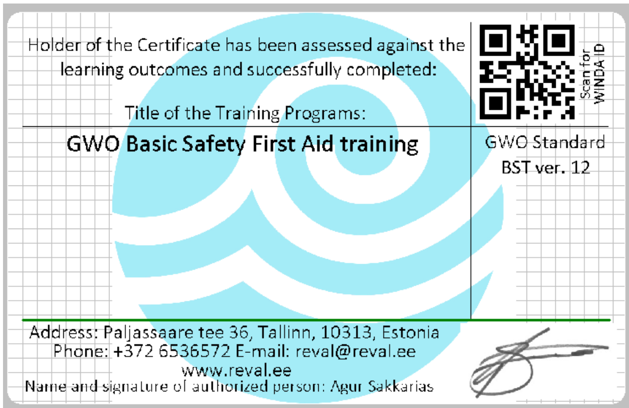
Reverse side of GWO First Aid certificate