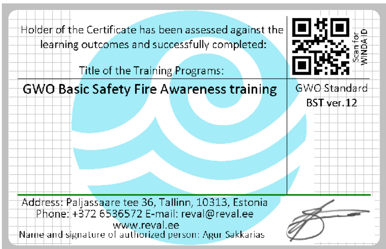
Reverse side of GWO Fire Awareness certificate